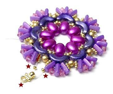
13) Pick up 1 SB15, 1 Pilos, 1 SB15 through the three SB15 and consolidate