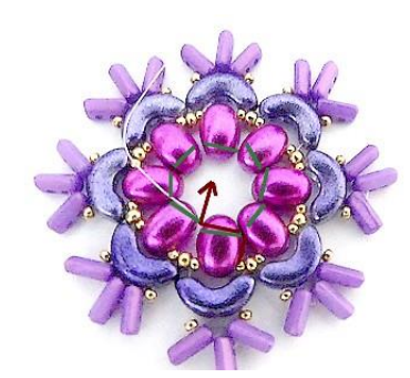
6) Here is the result Exit from the second hole of Samos and go through all Samos