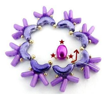
5) Pick up 1 SB15, 1 Samos, 1 SB15 between the SB11