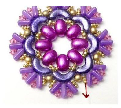
12) Here is the result Exit HERE through the three SB15