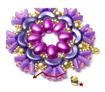
15) Pick up 1 B4 and exitHERE through the Piros.Repeat the entire row.End your thread