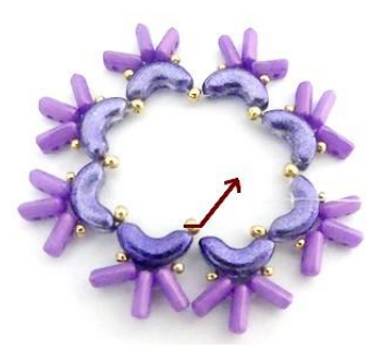
4) Repeat steps 1 and 2 to place the Arcos. Exit HERE through the SB11