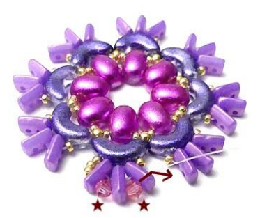
9) Pick up two times 1 B3 between the Piros