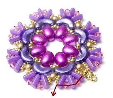
14) Exit HERE through the Piros