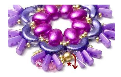
11) Pick up 1 RB3 through the SB15. Repeat the entire row the steps 8 to 11