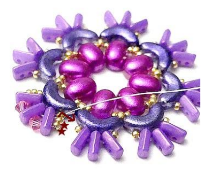
10) Pick up 2 SB15 through the SB15