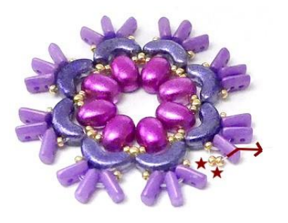
8) Pick up 2 SB15 through the Piros (second hole)