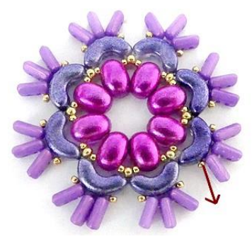
7) Exit HERE through the SB15